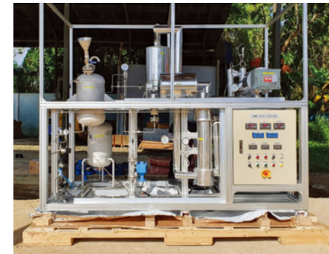
The first WTE(L) & DME(R) facilities installed in Indonesia